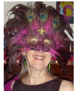
Feathered Caller of the Pacific NW