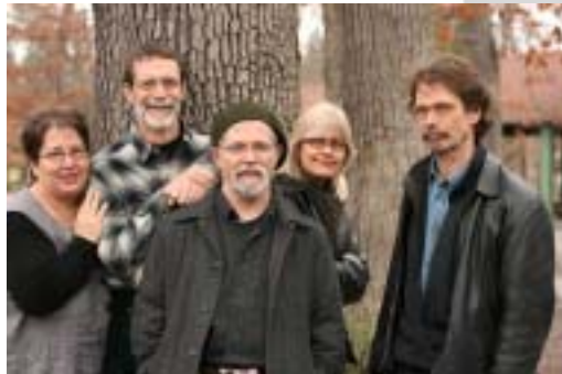
The Hotpoint Stringband

Hotpoint has been expanding the style of contra dance music through their inventive use of percussion, fascinating arrangements and catchy snippets of well-known tunes mined from such musical greats as The Rolling Stones, Bob Marley and Jerry Garcia. This is not your parents' contra music! Sneaking in through your ears, Hotpoint will take control of your body and run it at red line speed until the tank is empty.