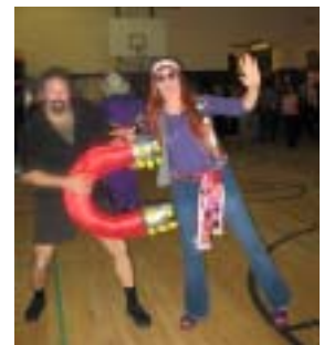
Portland's own chick magnet. Halloween '07

For more information: 503-249-5070 or 503-981-2179