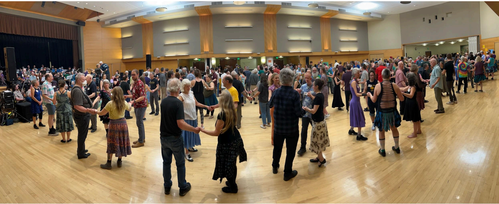
Panorama view of dancers at the 2025 Portland Megaband Dance.