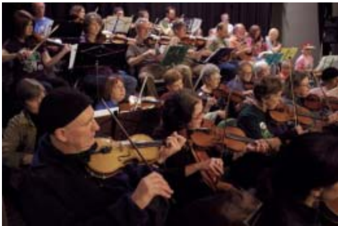
Megaband 2009