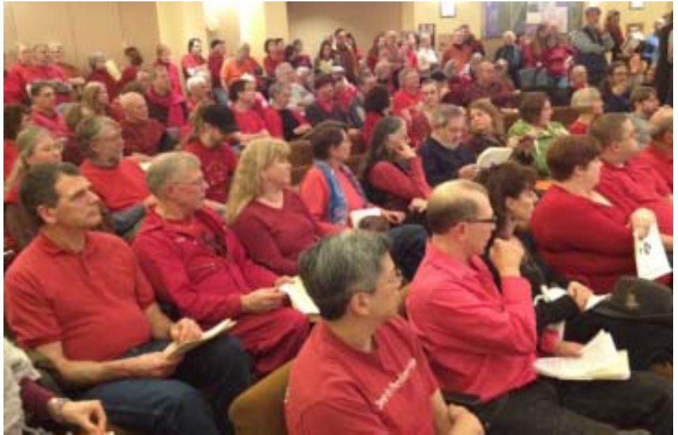
A 'Red Sea' of Fulton supporters at a recent budget forum.

The continuing efforts of all the individuals who want to keep Fulton open may yet succeed in saving this unique hall for the enjoyment of all its users. Press on.