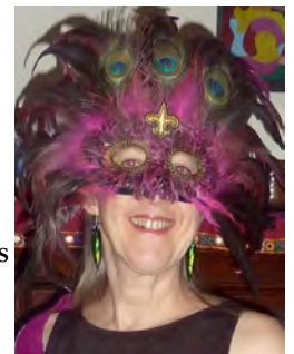
Feathered Caller of the Pacific NW