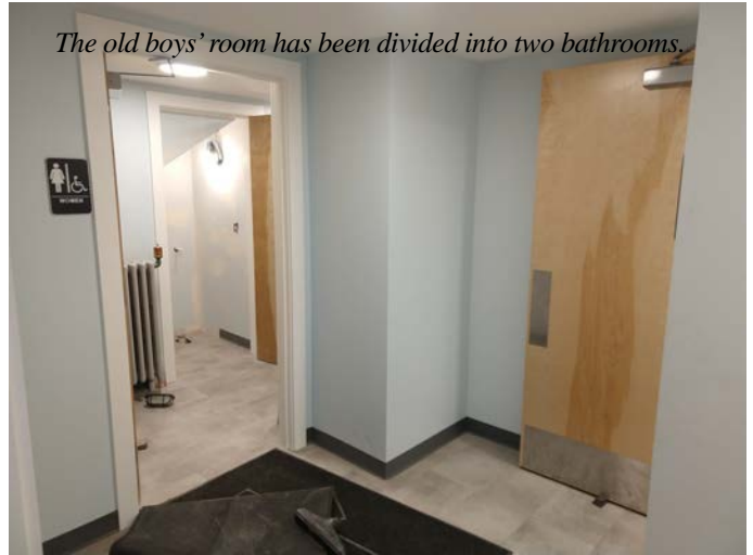
The old boys' room has been divided into two bathrooms.